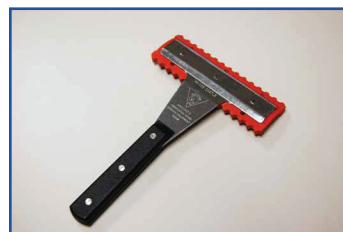
233-71AG grill wiper accessory for cleaning