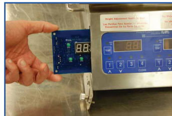
"Slide in, Slide out" control board feature